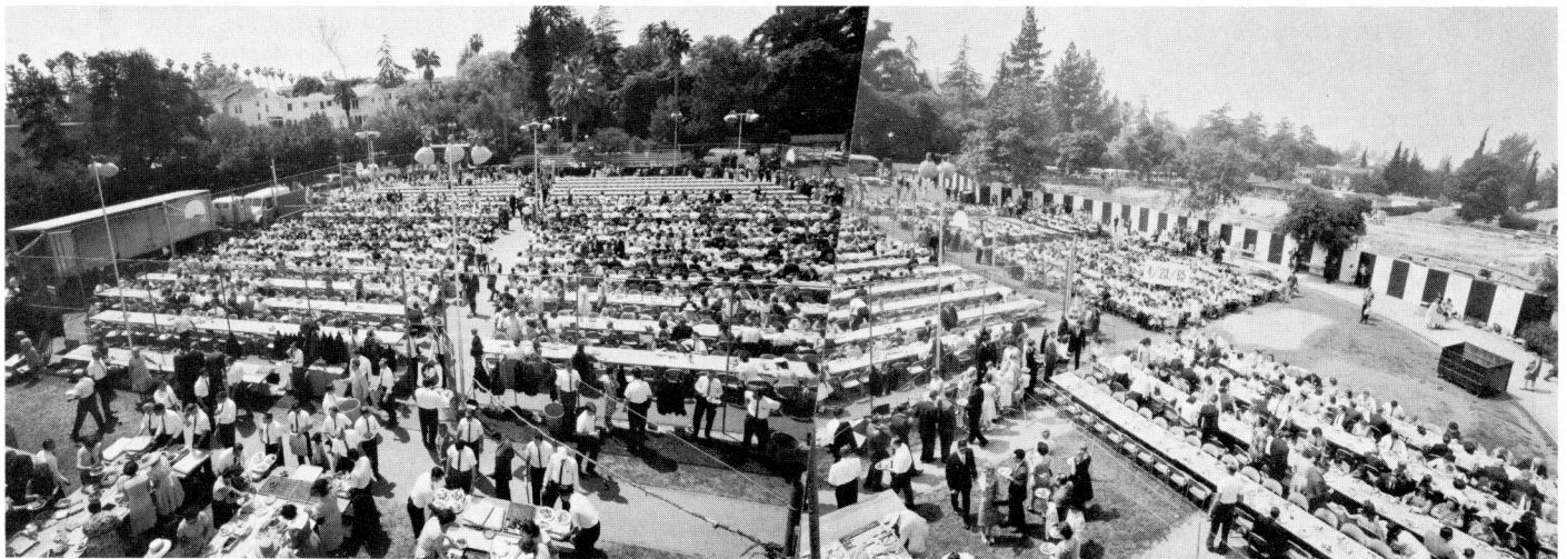
PANORAMIC VIEW—This composite of two photos gives you a revealing look at 3,000 headquarters area brethren feasting on the Ambassador College tennis courts, during recent holy days. Notice the large black

Brethren from San Diego to Bakersfield converged on the Civic Auditorium. There was "standing room" only at the Civic—as the many people had (Continued on page 3)