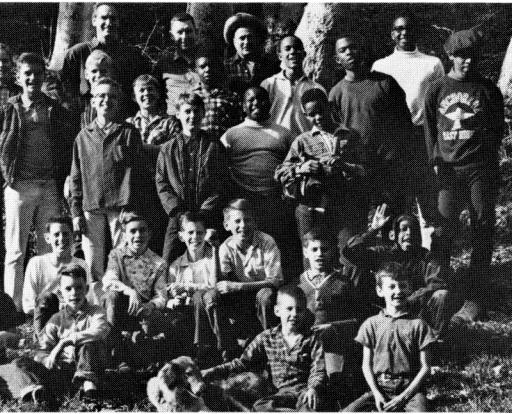
ALL SMILES—Recent outing produced these big smiles by Los Angeles Boys' Club members.